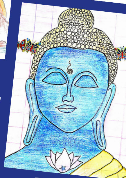
Tejasvi Class 6D